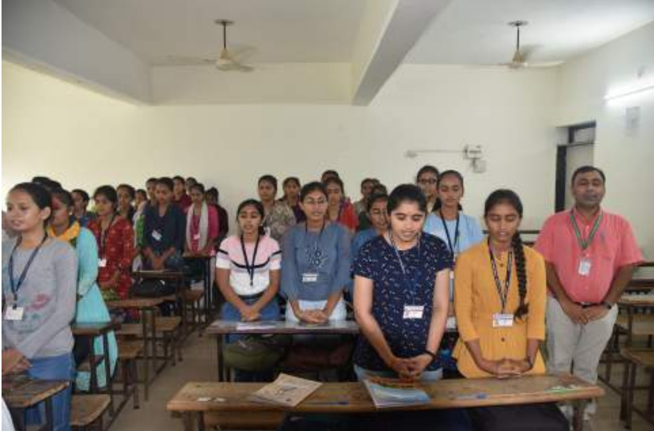
Total number of participants: 80 Students.